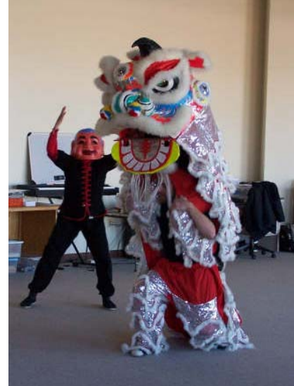
Above top, Above bottom, and Right- The 'Lotus Dragons' perform for TMES students.