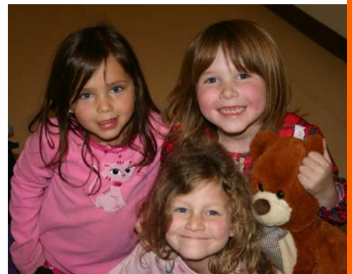
Above- Kindergarten girls enjoying Pajama Day on February 23 rd .