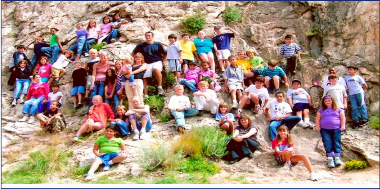
The 9-12 students enjoyed a rock-climbing adventure in the Jemez Mountains earlier this month.